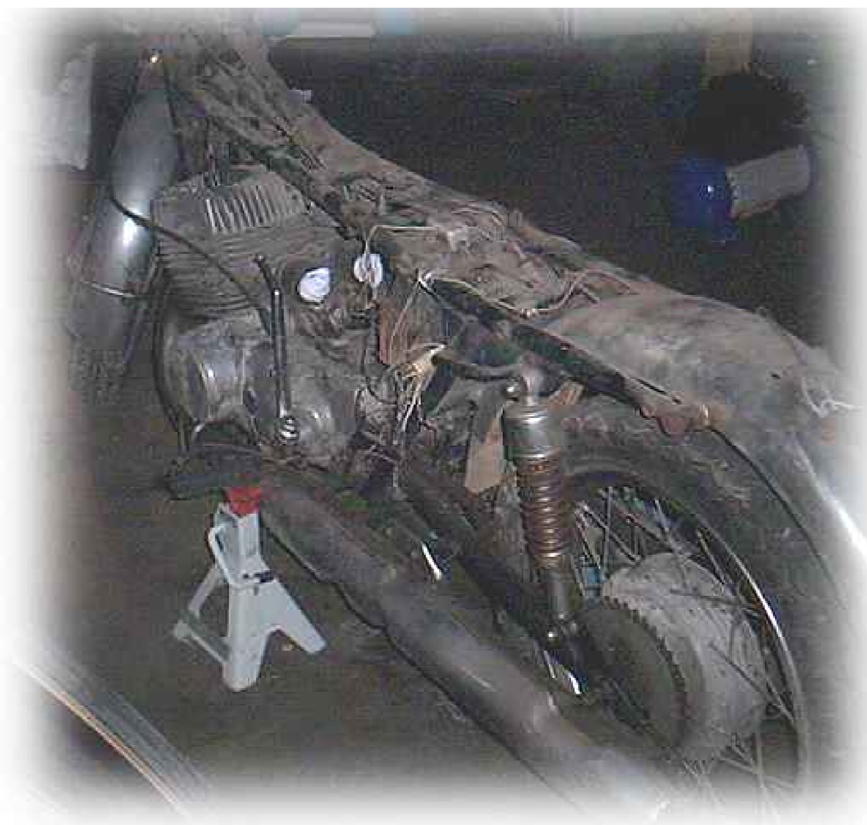
Heap with heaps of potential

I got the Titan inside today and had a looksee, hoping to fire it. The oil lines are trashed, the feed from the tank was gooped together. Got any good homemade fittings for it?