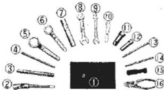
Fig. 32 Tool kit

A tool kit which includes all tools needed for daily maintenance is provided inside the battery & tool cover.