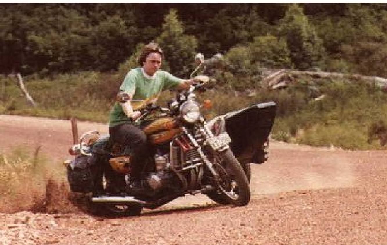
Opposite lock in the forest near Manjimup Western Australia