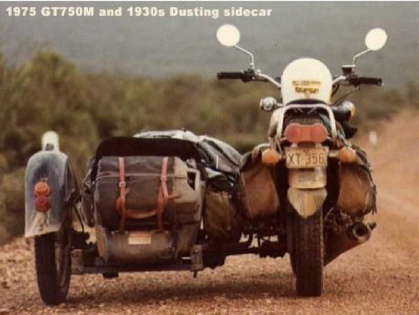
1975 GT750M and 1930s Dusting sidecar