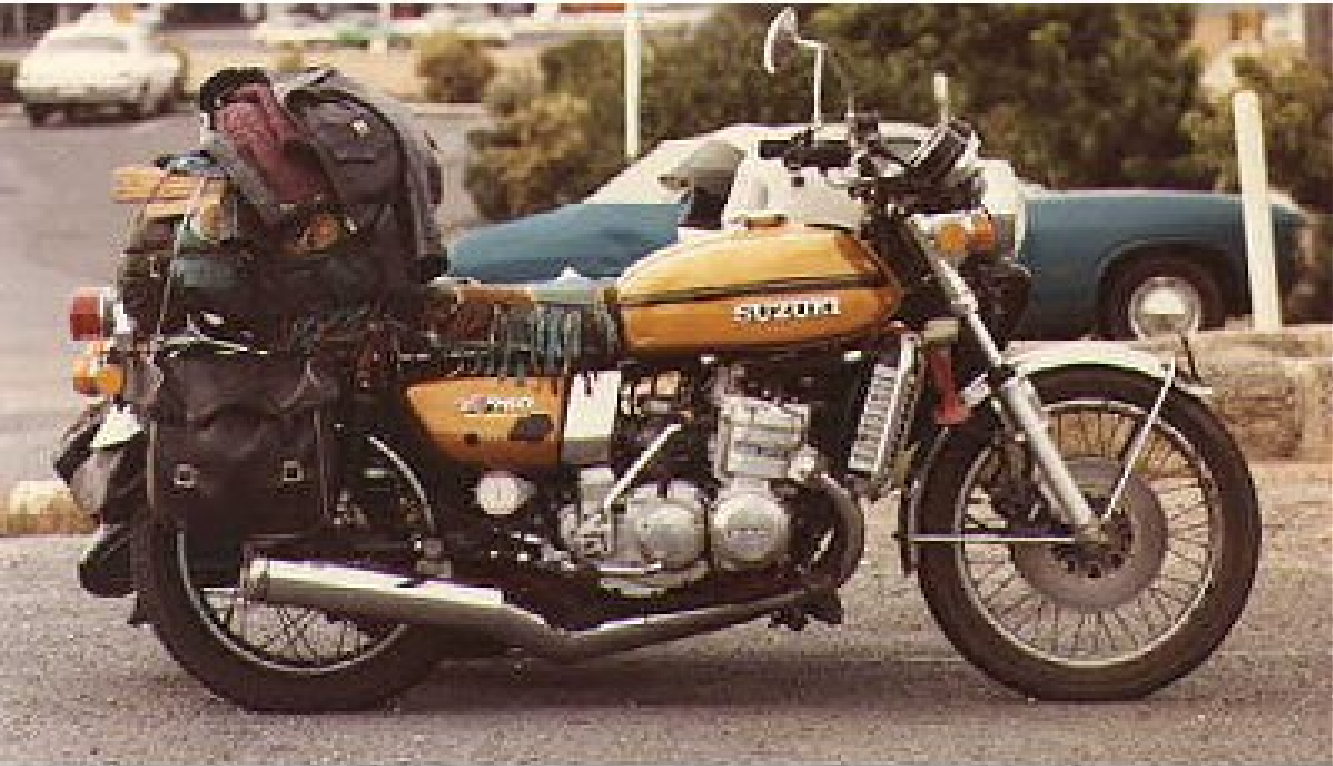
1975 GT750M with Bromlech 3 into 1 pipe