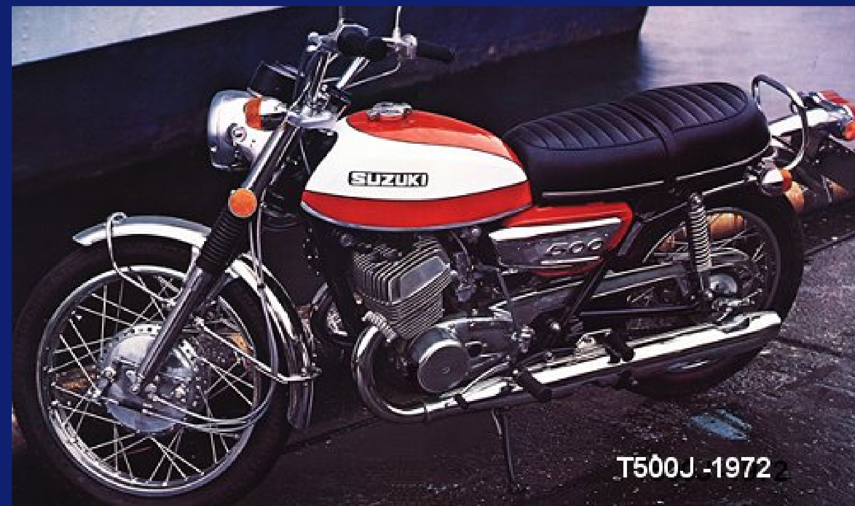
T500J to T500K