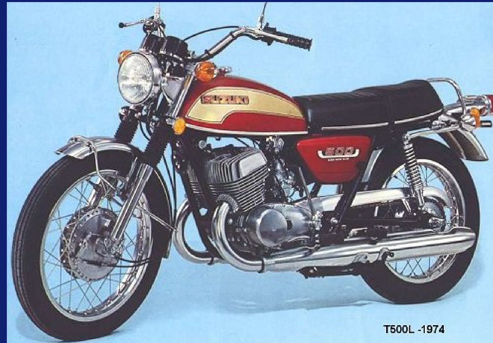
T500L - T500M