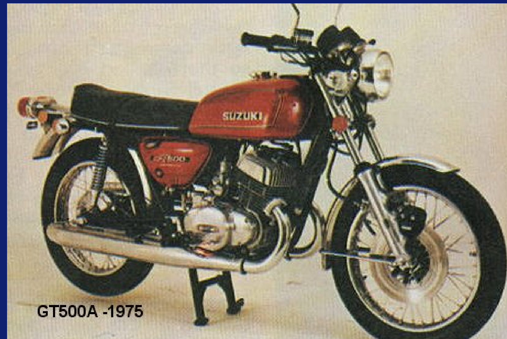
GT500A to GT500B