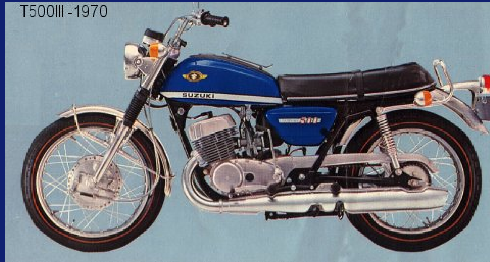
T500-III to T500R