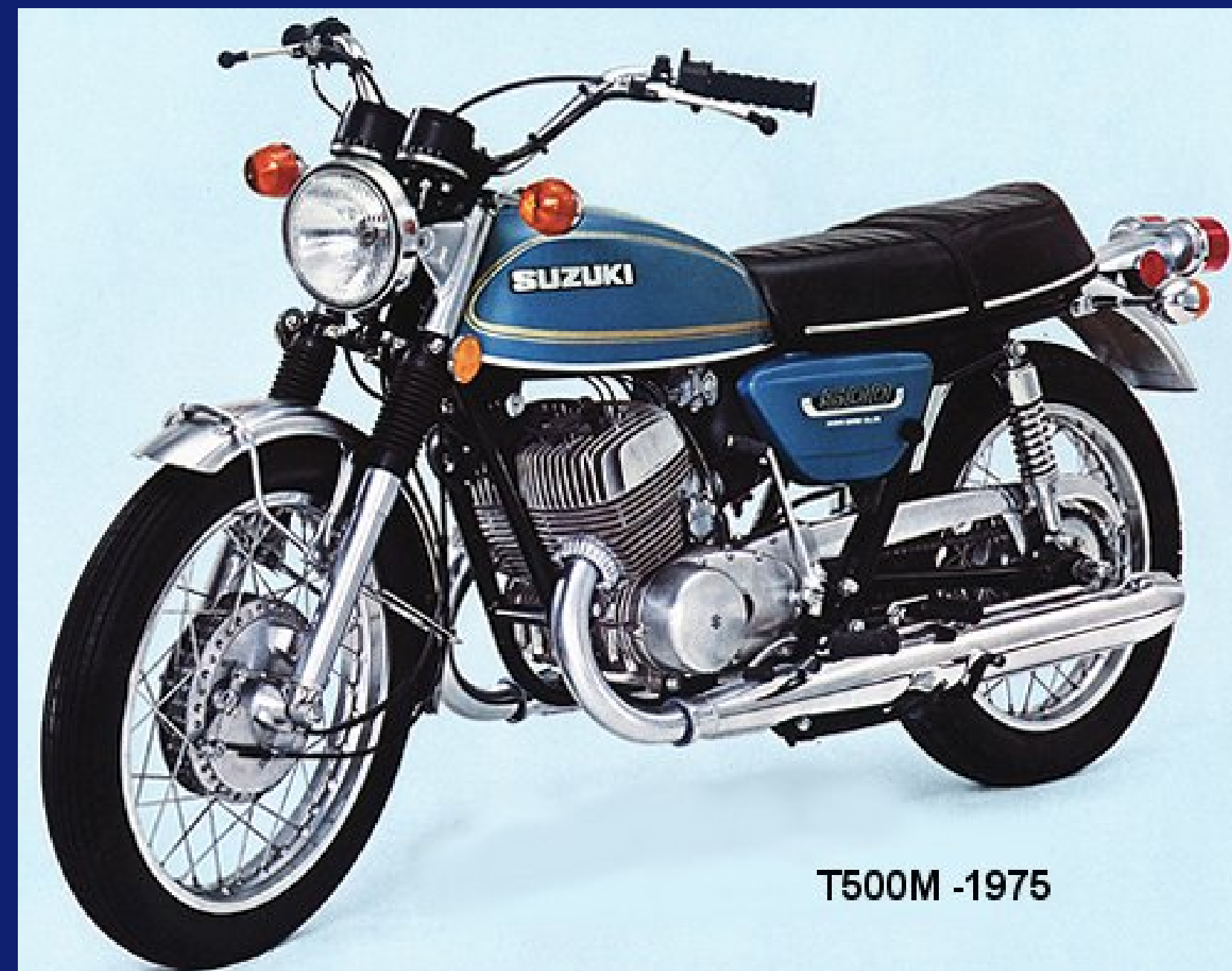
T500M - GT500A