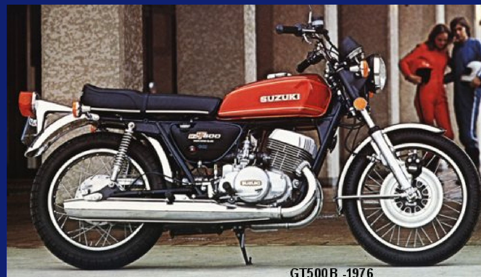
End of the road