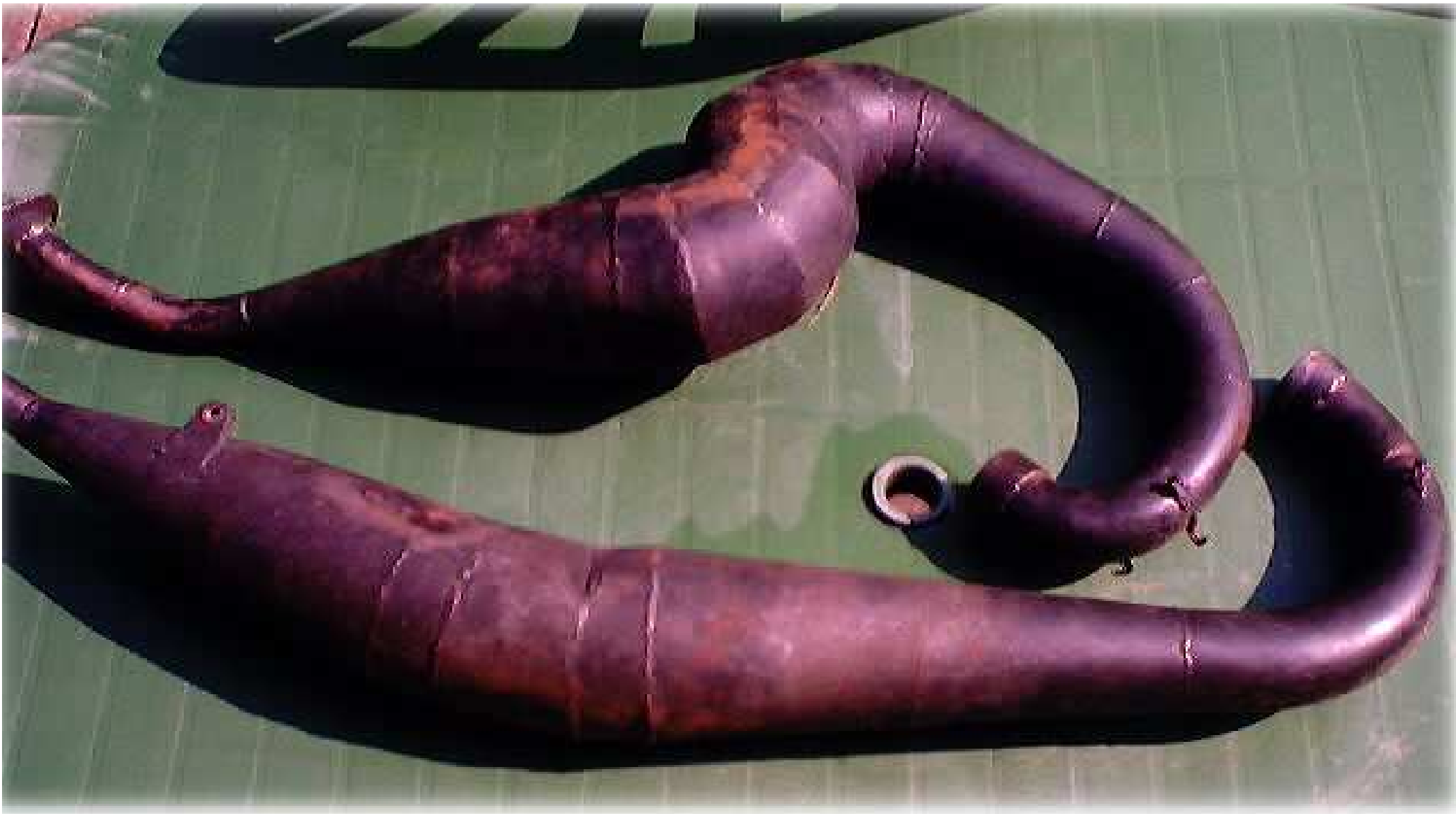
A pretty wild set of pipes here. Look like they may be peaky.