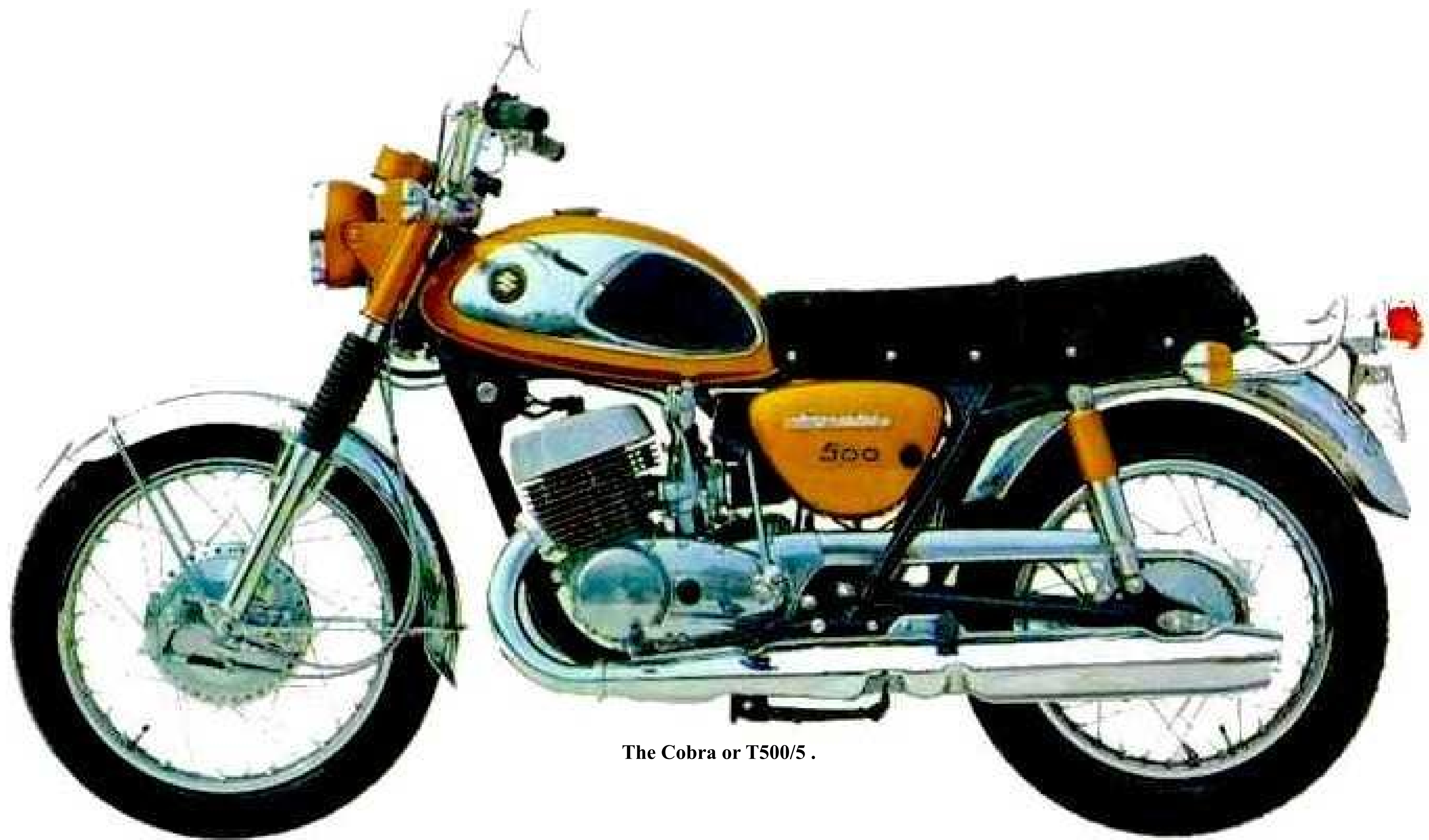
The Cobra or T500/5 .