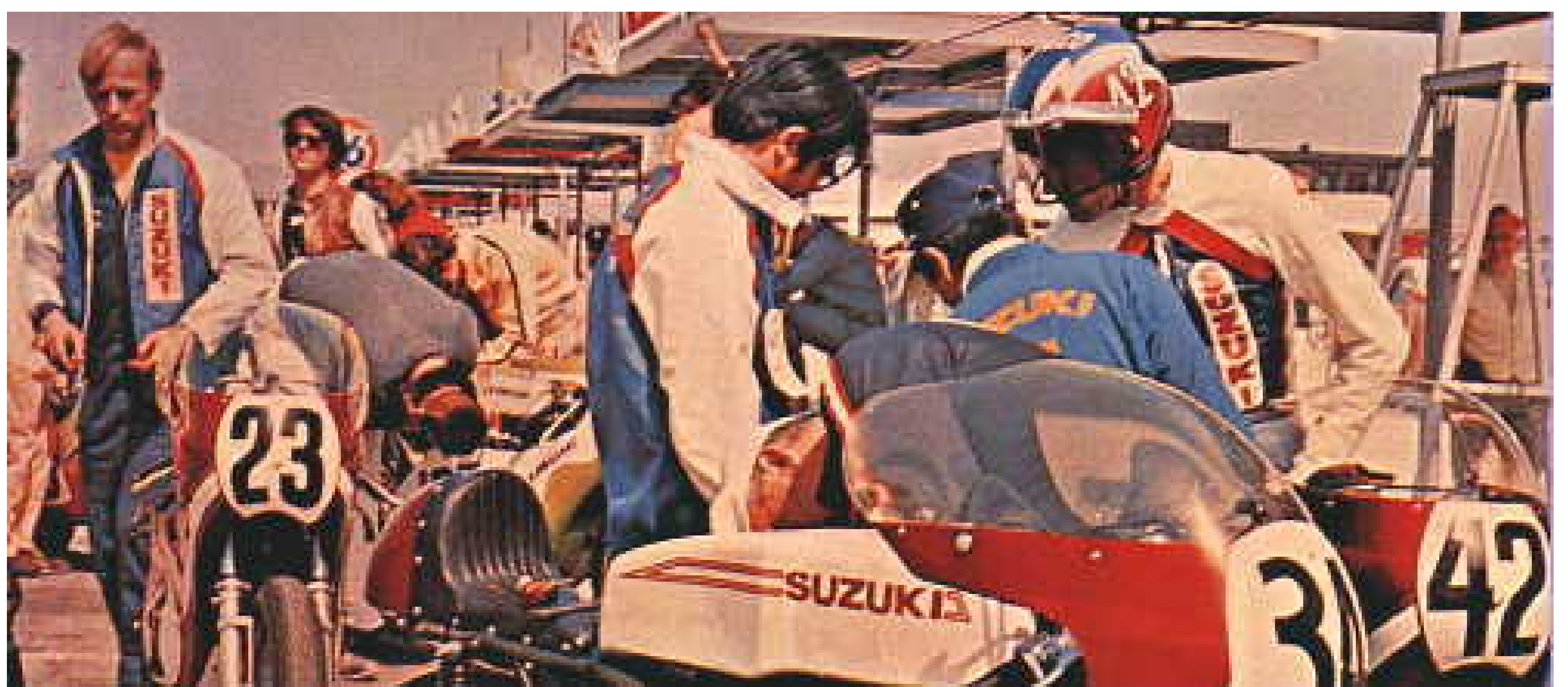
TR500s at Daytona 1971