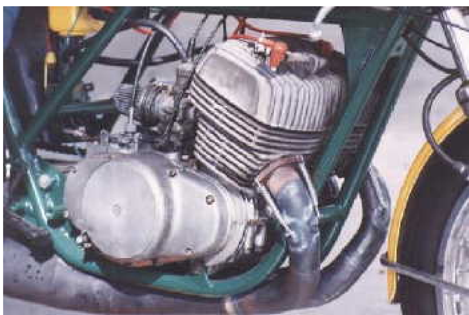
The engine and frame of Muzza's spare Titan based racer