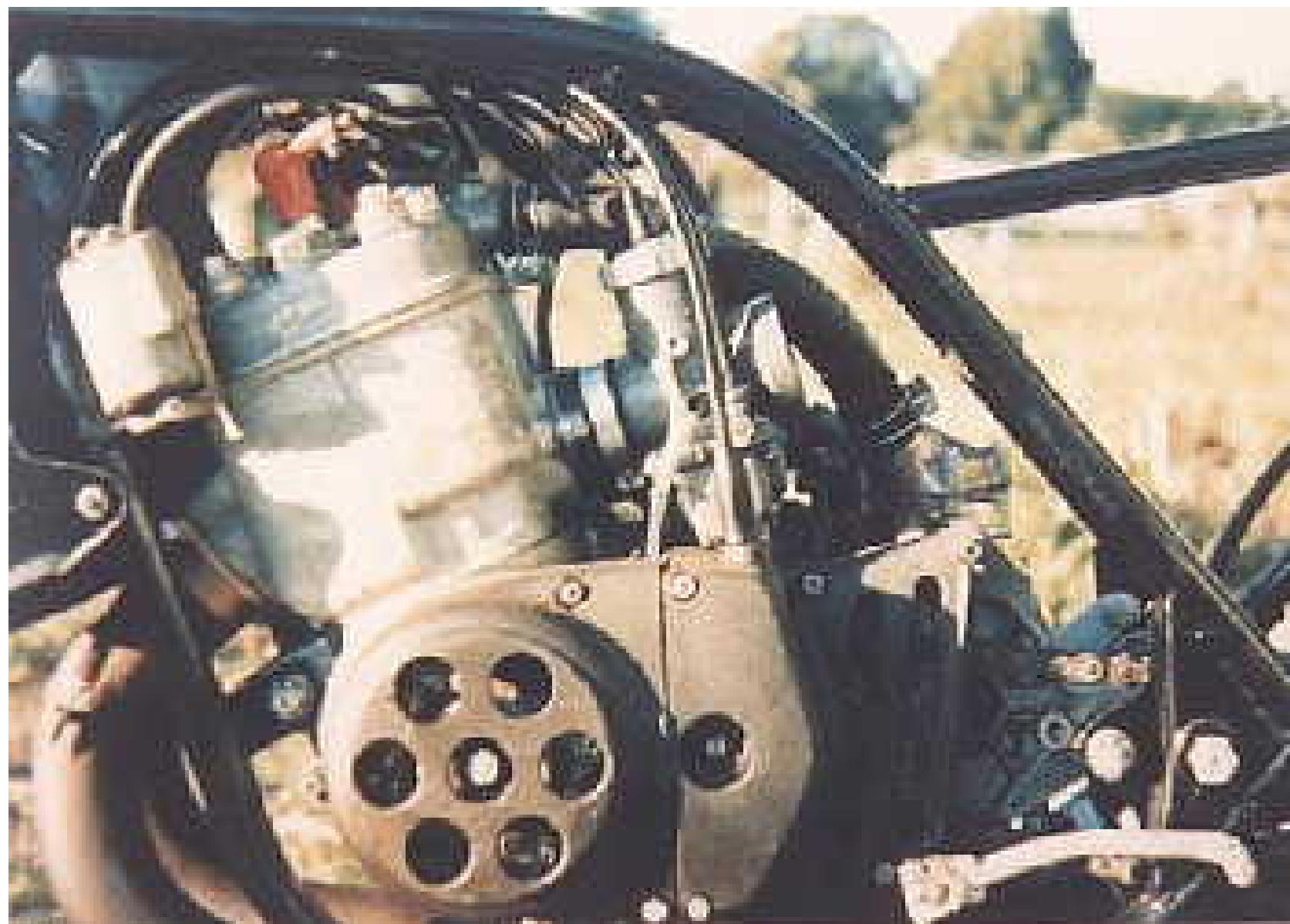
The last of the breed, the TR500 MkIII water-cooled motor