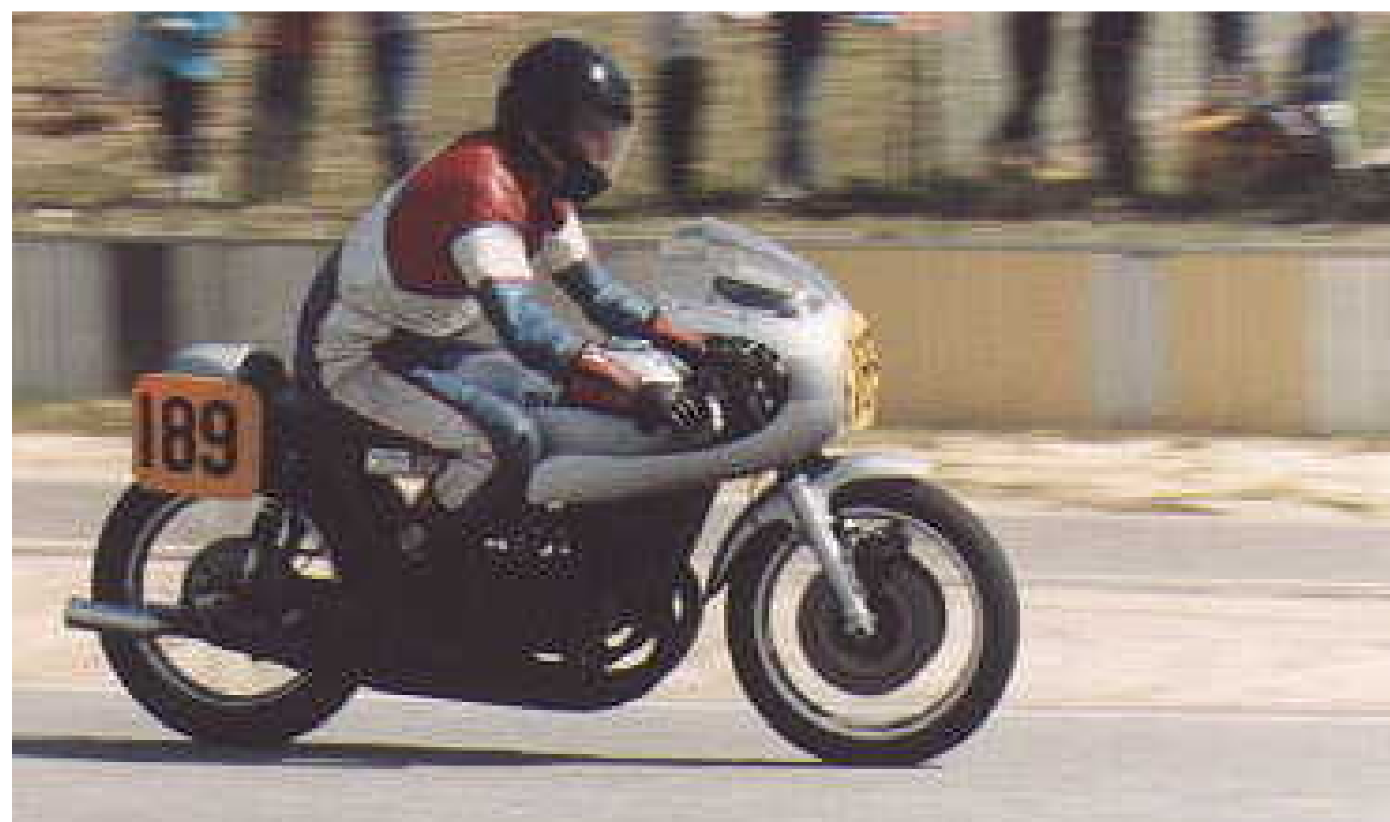
Muzza's 3rd Titan racer