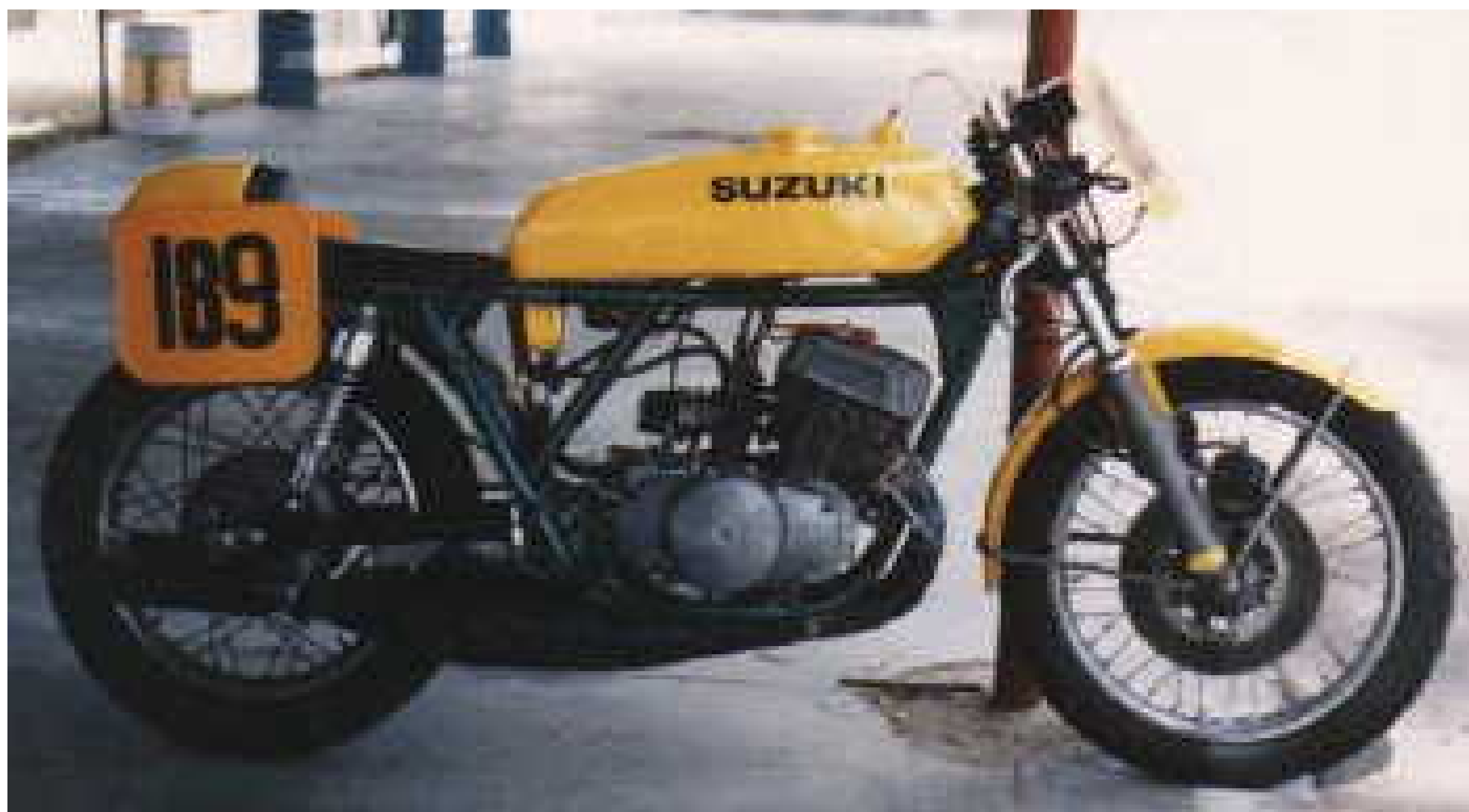
Muzza's spare Titan racer