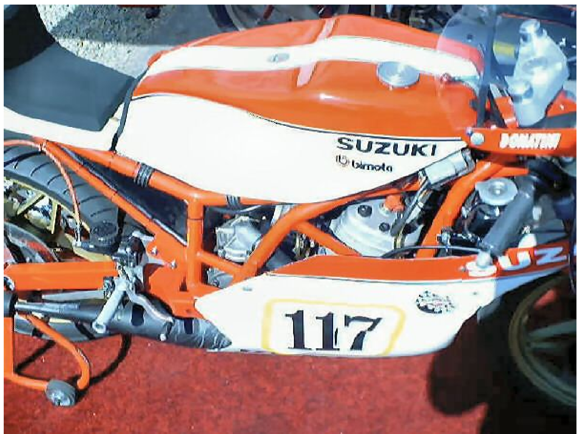
Probably the most beautiful TR500 built, using the 85BHP Mk3 motor the Bimota was built for an Italian Bimota only race series.